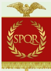
Fig 2 SPQR Banner

upstretched and clutching the lightning bolts of Zeus was used as an Aquila to lead Roman legions into battle. (Fig. 3) The eagle also graced Roman coins with poses similar to those found on our