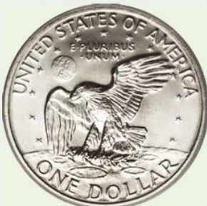
Fig 18 Ike Dollar