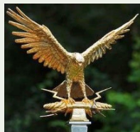
Fig 3 Aquila