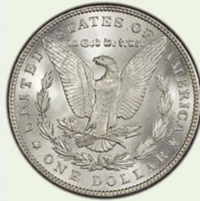
Fig 16 Morgan Dollar

United States Mint & Coin Act URL, http://www.coinact.com/p/an-act-establishing-mint-and-regulating.html