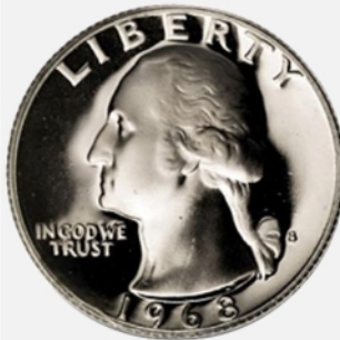
Cameo Ring Faces Proof Cameo Washington Quarter

revolves like the spokes of an imaginary wagon wheel. This term is often used in describing brilliant uncirculated silver dollars.