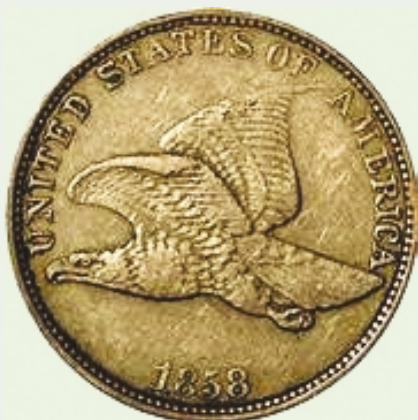
Fig 1 Flying Eagle Cent

Minor coinage such as cents, and half cents were excluded from these particular regulations; and were given a set of rules just for them. This did not preclude Lady Liberty and eagles being displayed on minor coins as well—for example, the flying eagle cent! (Fig. 1) Later in the U.S. history of coinage the designs for circulating commemo-