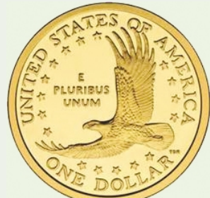
Fig 20 Sacagawea Dollar