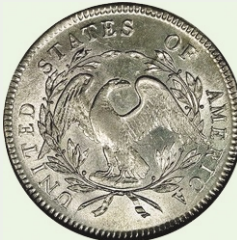
Fig 7 1794 Dollar