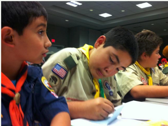
Boy Scout Merit Badge Workshop