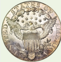
Fig 9 1802 Dollar

Meantime, another debate related to the debate about “Natural” vs. “Emblematic” eagle had continued in the background. There were several role models to promote an emblematic eagle including Dupres’ commemorative medal which honored the declaration of American independence, Brasher’s doubloon 1787, Massachusetts cent of 1788, and the artistic display of the U.S. National Seal (1782) which is described as following: an eagle with wings uplifted in flight, flying with independence, holding in its left talon arrows for war and in its right an olive branch for peace with a shield representing the congress (top horizontal) and the 13 colonies in stripes (bottom pales and paleways). The heraldic eagle designs (quite stylized and rigid) are often different than the designs used by mint engravers in that the body and wing positions are often different, the eagle sometimes has a banner held in his beak and the shield differs in size and position—as well as other slight differences. The result of this debate continues today with the naturalistic eagle on some coins and a more stylized emblematic eagle on others; and different opinions as to which is the better design for our coinage.