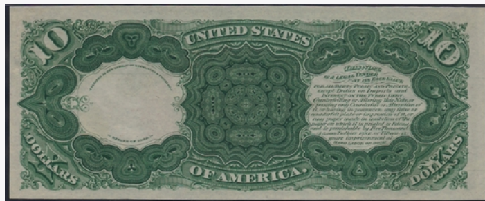
Jackass Reverse LG Seal