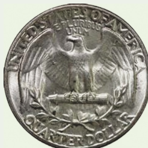
Fig 14 Washington Quarter