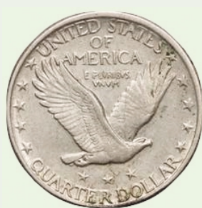
Fig 12 Standing Liberty Quarter