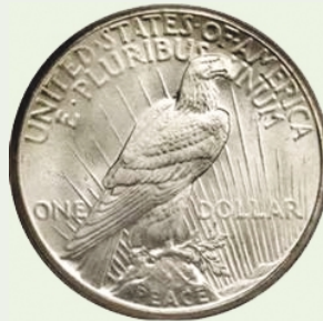
Fig 17 Peace Dollar