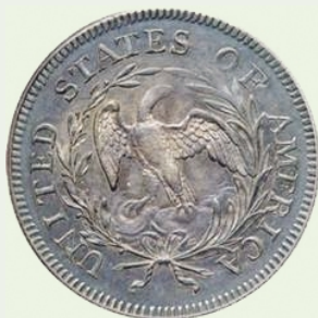
Fig 8 1796 Quarter