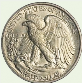
Fig 13 Walking Liberty Half

Enjoy our beautiful coinage and rejoice in being collectors of the history embraced by its designs! See you in the next issue with Part II.