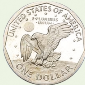
Fig 19 Susan B Anthony Dollar