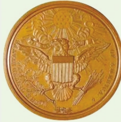
Fig 5 US Diplomatic Medal