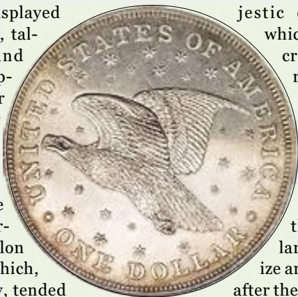
Fig 10 Gobrecht Dollar

Meantime the heraldic eagle resumed dominance in the competition of natural vs emblem. Charles Barber's quarter and half dollar showcased a heraldic eagle (Fig 11); however, in 1916 MacNeil's Standing Liberty quarter displayed a gracefully natural eagle—wings outspread flying to the right. (Fig 12) In the same time period, Weinman's gorgeous Walking Liberty shared coin turn with an incredibly powerful eagle on the ground, striding to the left with wings uplifted and