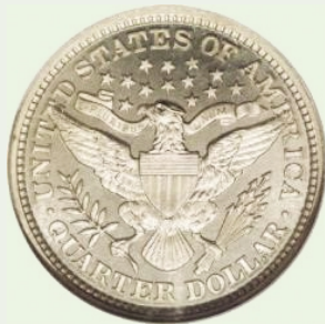
Fig 11 Barber Quarter