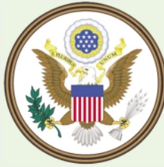
Fig 4 National Seal

The use of an eagle in art such as Benjamin West's paintings and Dupre's stunningly beautiful Diplomatic Medal (Fig. 5) was well-known in the American colonies; and had a very strong influence on the later coin designs. The motivations and intentions of the law-makers were all very idealistic; unfortunately the equipment and die-cutting skills available to the young nation were quite limited. Coins were struck with a screw press powered by horses. Collars to retain the coin planchet to a constrained diameter, as well as steam driven mint equipment were not available for use until the mid-1800's. Although the mint staff learned rapidly how to remedy some of the striking, working die and planchet problems; nonetheless the early eagles were engraved with shallow depth in order to facilitate strike. This resulted in a beginning coinage in which the eagles earned nicknames like: scrawny, sickly, goose-necked, chicken-like and tubular. (Fig. 6-1792 half dime); (Fig. 7-Silver dollar of 1794); (Fig 8-1796 Quarter).