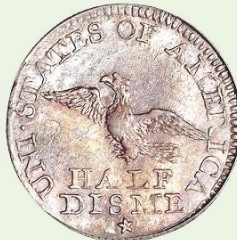
Fig 6 1792 Half Disme