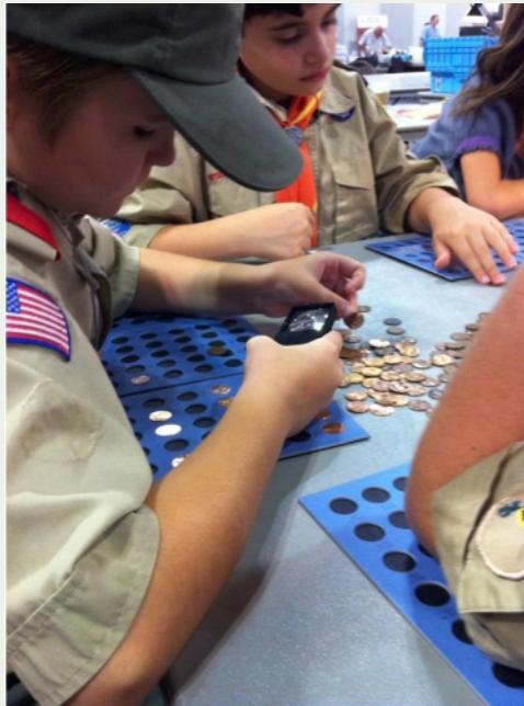
Scout Helping Cub Scout Brother

They are in numismatics for the fun, historical, social recreation value and fellowship camaraderie numismatics has brought them over the years rather than primarily the money making investment angle — though from the long term standpoint of say thirty or more years one could receive a tidy profit from selling off a collection at auction, coin dealer or fellow hobbyist.