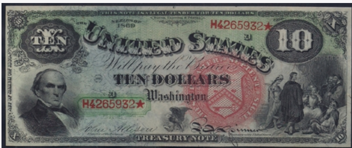
Jackass Obverse Rainbow