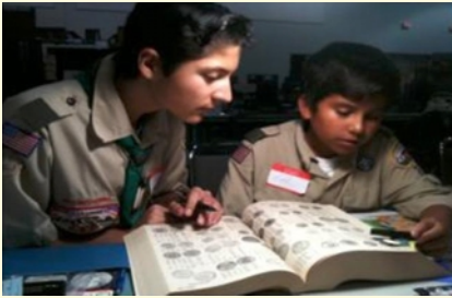
Boy Scouts Looking Up A Coin In Krause