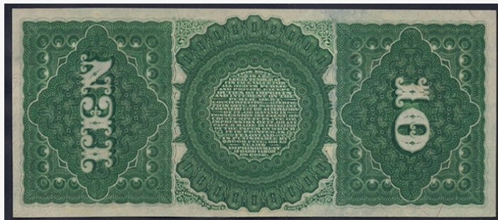
Jackass Reverse Rainbow