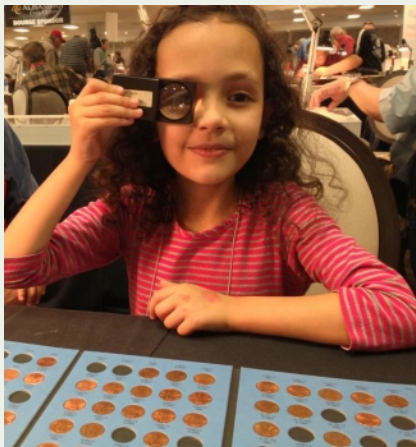
Having Fun Collecting Coins

Coins do talk to a collector-hobbyist in many ways. They can serve as educational tools which enlighten