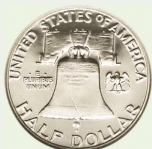
Fig 15 Franklin Half Dollar