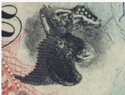
Upside Down Eagle Becomes A Jackass

The “Jackass” Notes are the 10 Dollar Legal Tender Notes dated from 1869